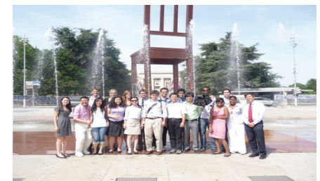
Fellows gather near the Palais de Nations at Geneva's famous Broken Chair.