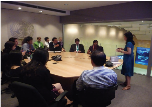
Students are introduced to Pandemic Preparedness at the WHO's Strategic Health and Operations Centre, the global hub for monitoring and managing pandemics.

In the summer of 2011, Duke University's Sanford School of Public Policy will bring the seventh cohort of Global Health Fellows to Geneva. Designed to equip students to join in the fight against HIV/AIDS, tuberculosis, malaria, and other pressing health challenges, the Global Health Fellows Program will provide students with both an academic and experiential perspective on how inter-governmental institutions, public-private partnerships, and non-governmental organizations shape global health policy. By combining internships and an intensive course on global health issues, the program is a unique opportunity to learn first-hand how global health policy is formulated and implemented. This past year, 19 graduate students drawn nationally from schools of public policy, public health, law and medicine participated in the summer experience.